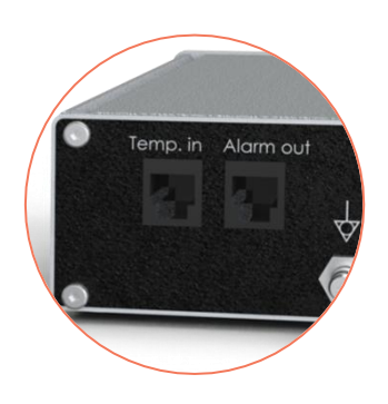
NO & NC alarm outputs