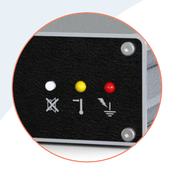
Alarm for Isolation fault & overload

Isolation monitor for mobile applications