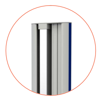
Cable channel & Stainless steel mounting pole