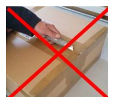
Prevent sharp objects to scratch the cover

Never use a sharp object, such as a Stanley knife to open the package.