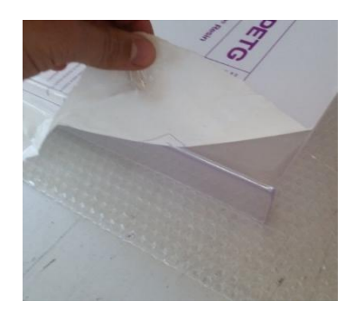
Remove protective films

If it is necessary to use a sharp object to release the tape for example, always make sure that the sharp object cannot touch the monitor cover. Before use, remove the protective films on both sides of the cover.