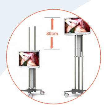
Gas spring balanced with 80cm height range

80cm gas spring balanced height adjustment