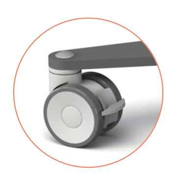
100mm double wheel casters