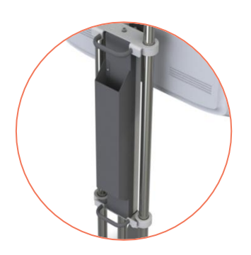
Integrated holder for power adapter & wiring