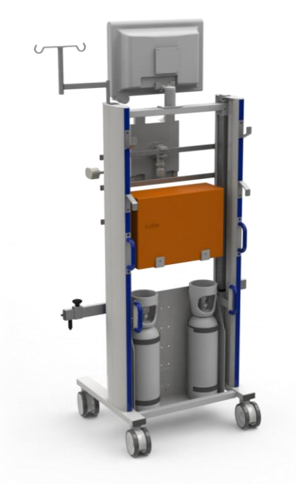
Flexx two configuratie