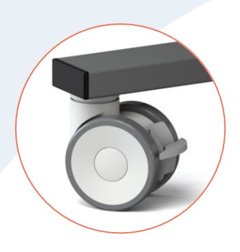
100mm double wheel casters