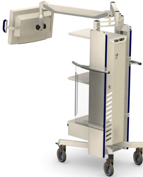
Storing the cover during use of the monitor

While using the monitor, the protection cover can be stored by hanging it on the handle of the cart.