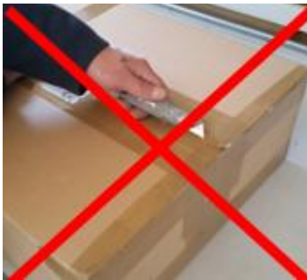
Prevent sharp objects to scratch the cover

Never use a sharp object, such as a Stanley knife to open the package.