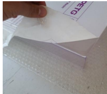
Remove protective films

If it is necessary to use a sharp object to release the tape for example, always make sure that the sharp object cannot touch the monitor cover. Before use, remove the protective films on both sides of the cover.