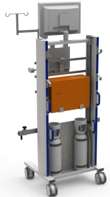
Flexx two configuratie